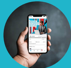
Multiple social media ads