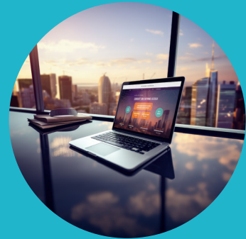
Multiple landing pages